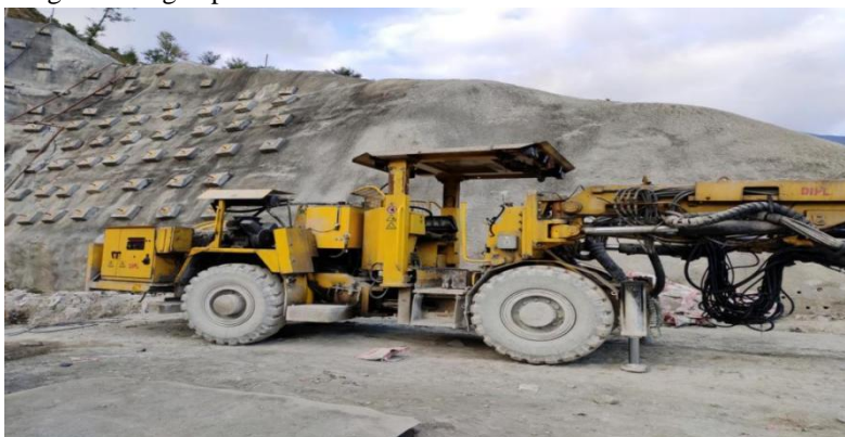
Fig 4.2: Drilling Equipment

The depth of the drill ranks third in influencing over-break in tunneling, with an RII of 0.867 (Table 3.1, Fig 3.1). Consistent rankings are observed across Middle Mewa (RII=0.889), Ghar Khola (RII=0.844), Lower Solu (RII=0.874), and Solu Dudhkoshi (RII=0.853). In drill and blast tunnel construction, the depth of each drilling cycle significantly impacts over-break. It's determined by experienced geologists or experts based on rock type and drilling machine capacity. Weak rock requires shallower drilling, while stronger rock necessitates deeper drilling. Longer drilling depths increase over-break likelihood in tunnels.