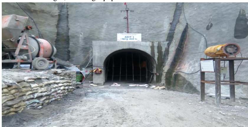
Fig 4.7: Inverted D shaped tunnel of Lower Solu hydro-project

Tunnel shape and sizes rank sixth with an RII of 0.848 (Table 3.2). Middle Mewa (RII = 0.900), Ghar Khola (RII = 0.889), Lower Solu (RII = 0.821), and Solu Dudhkoshi (RII = 0.800) maintain consistent rankings. Tunnel construction is influenced significantly by shape and size, where larger tunnels entail higher excavation risks. Tunnel shape also impacts construction ease and stability. Most tunnels range from 2 to 6 meters, except for those supporting hydro-power capacities exceeding 100 MW. Common shapes like Inverted D and horseshoe ease construction but may compromise self-stability, unlike the circular shape. Optimal designs balance stability with construction challenges, affecting equipment movement and over-break control.