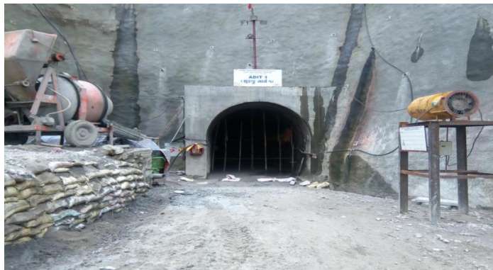
Fig 4.4: Tunnel Geology

The tunnel geology is found to be the third most significant challenge in the drill and blast method of tunneling having third rank with RII=0.915 as shown in the table 3.2 and fig 3.2. As shown in the Table 3.2, there is consistency of ranking among Middle mewa ( RII=0.978 ), Ghar khola ( RII=0.911 ), Lower solu ( RII=0.916 ) and Solu dudhkoshi ( RII=0.863 ). The tunnel geology is very important parameter that determines the productivity in tunnel construction. Being as very young rock type of abundantly sedimentary and metamorphic rock having thin to thickly jointed rock mass creates problem in tunnel excavation with vast variation in tunnel alignment cause problem in tunnel excavation.