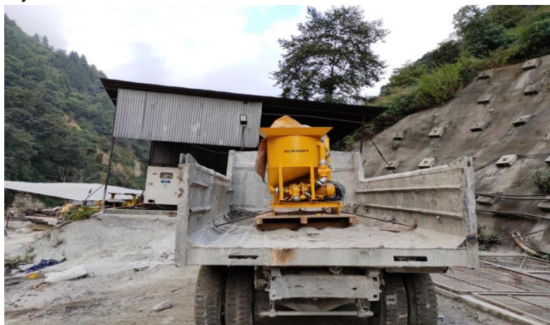
Fig 4.5 : Tunnel Equipment

Construction equipment ranks fourth with an RII of 0.876 (Table 3.2). Middle Mewa ( RII=0.900 ) and Ghar Khola ( RII=0.889 ) maintain consistent rankings, as do Lower Solu ( RII=0.842 ) and Solu Dudhkoshi ( RII=0.874 ). Hand-held drills, particularly jackhammers, are commonly used underground for their cost-effectiveness. These drills, manually operated or with a pusher leg attachment, can bore holes ranging from 25mm to 50mm in diameter, with a maximum depth of 4m (practical limit being 3m). Drifter drills, featuring hammers sliding on booms, are also utilized, primarily for vertical and horizontal drilling. Equipment, mainly imported from India and China, includes mucking tools like hagg loaders, wheel loaders, and backhoe loaders. However, challenges persist in acquiring the right equipment, spare parts, and managing costs, significantly impacting tunnel construction timelines in Nepal due to limited availability in the local market.