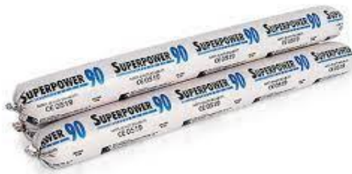
Fig 4.6: Explosive for Tunnel

good quality of explosive will makes better working environment in tunnel by making less gas production in blasting leading to safe and better working environment for tunnel works.