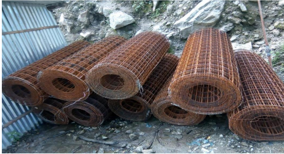
Fig 4.8: Wire mesh for Tunnel support